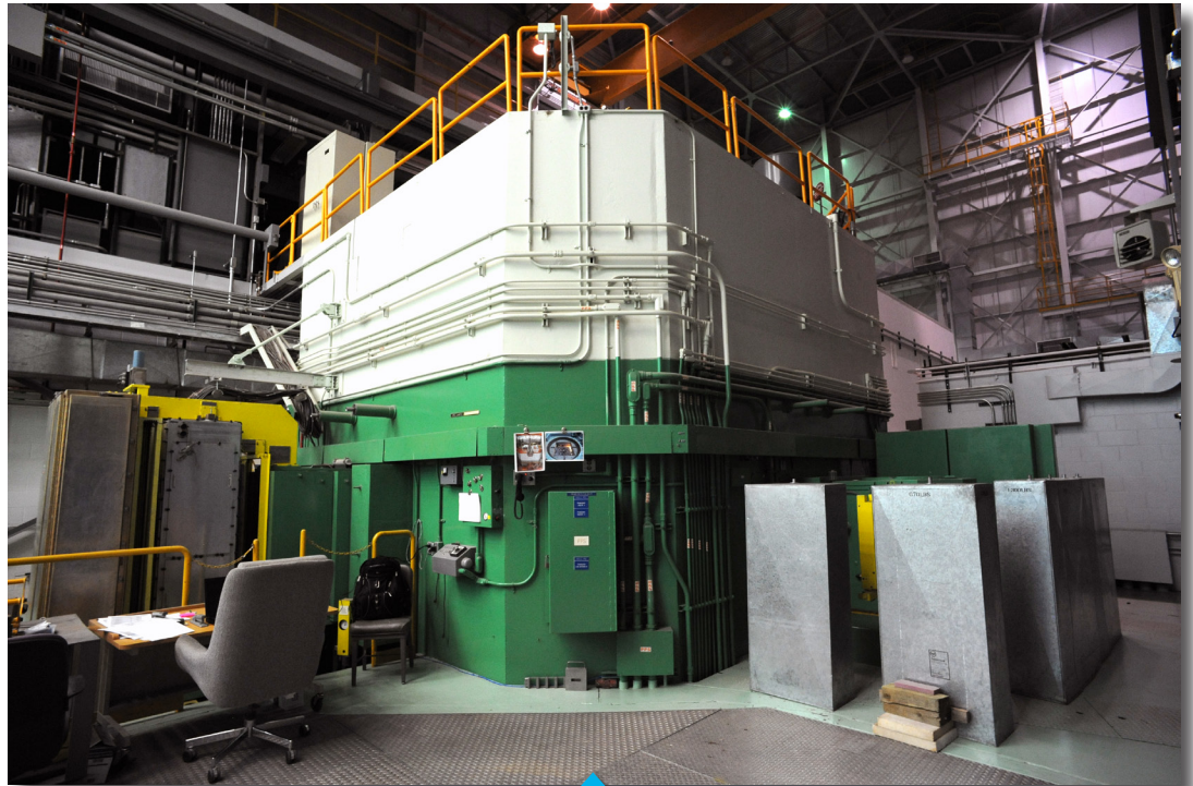
Although TREAT has not operated since 1994, return to operable conditions and resumption of testing is believed feasible and is currently under consideration by DOE.